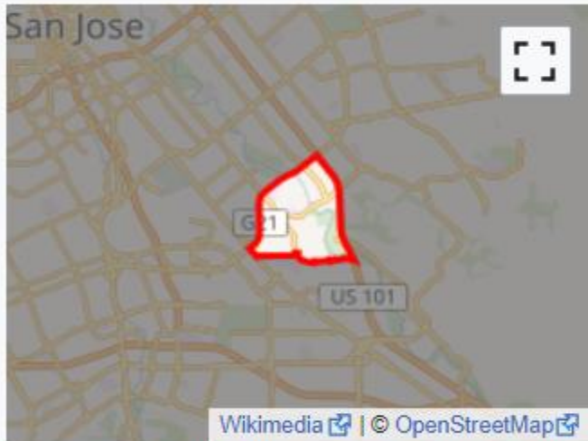
Location in Santa Clara County and the state of California