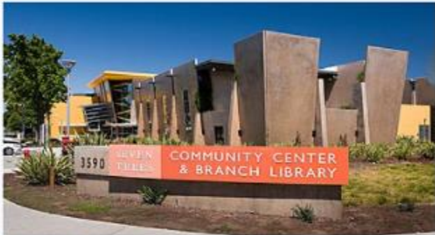
Seven Trees Community Center and Library, part of the San José Public Library